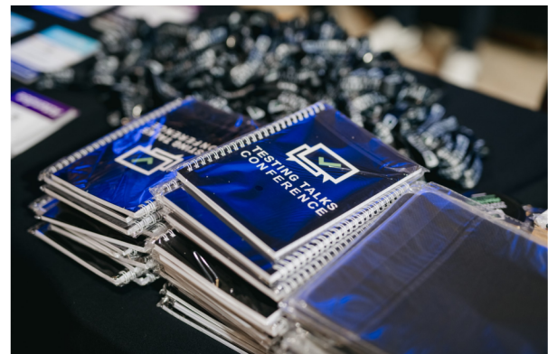
GAMES, SWAG AND PRIZES