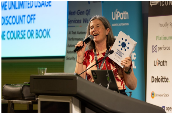
INDUSTRY LEADING SPEAKERS